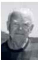
By Town Historian Branwell Fanning

Until 1931 Tiburon Boulevard, aka State Highway 131, terminated at San Rafael Avenue. The way into downtown Tiburon was via San Rafael Avenue, along the shore of Belvedere Island to Beach Road and Main Street. Construction had been underway since 1928 to extend Tiburon Boulevard to its present junction with Main Street and Paradise Drive, but it was slow going.